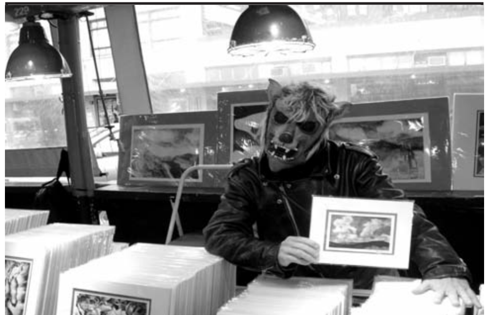
A favorite thing about the Market is you never know what you will find, and maybe thats the BEST thing. The craftline is a brilliant example... Paintings from a wolf.

The Market Bookshops each have their specialty so depending on what one wants determines their fave. Left Bank Books elicited the most definite