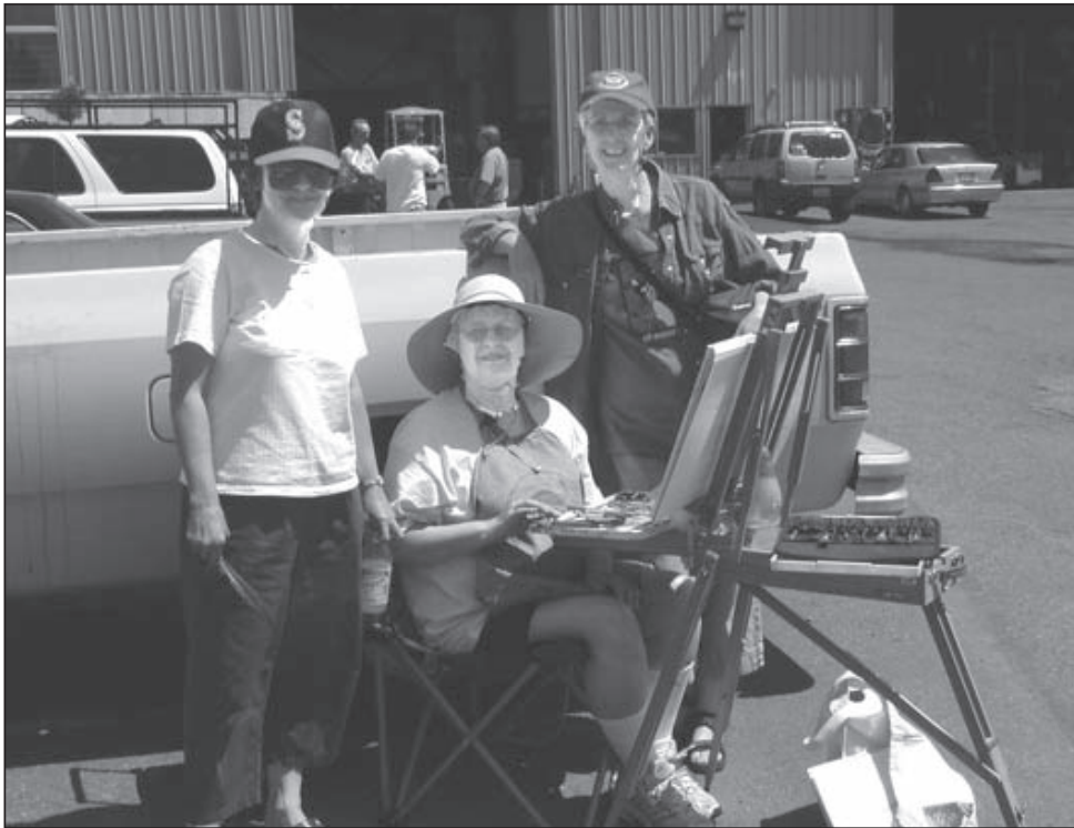
Art Stall sisters do a "paint out" in Fremont.