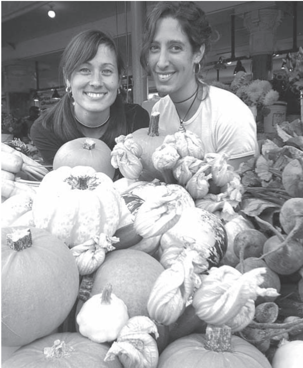
Winter squash and root vegetables are in season now at Frog's Song Farm.